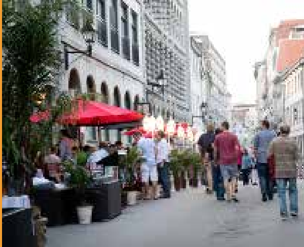
BIXI bikes may be rented at over 500 stations throughout Montréal and may be returned to any station.