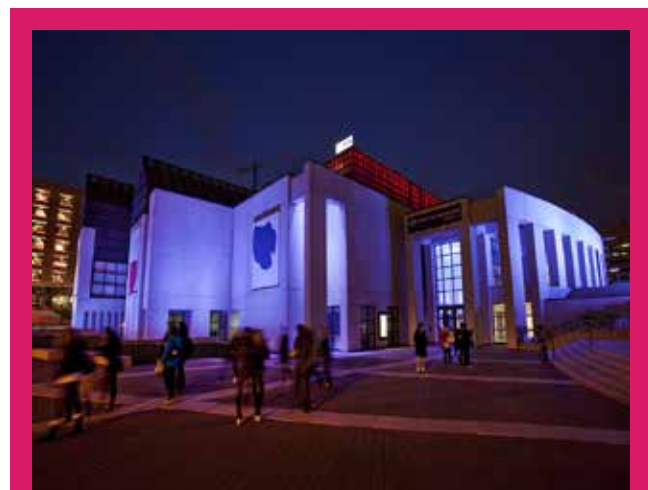
Musée d'art contemporain de Montréal (MAC) is part of Montréal's famous Place des Arts complex.

Each Champion Sponsor receives special recognition in the opening and closing general sessions. In most cases, individual slides of Champion logos are part of the conference slide show preceding general sessions. ( Champion Benefits continued on next page. )