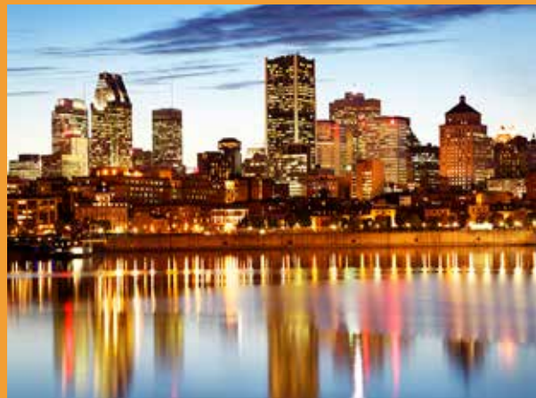
Downtown Montréal is stunning from Mount Royal Park.

CHI 2018 offers many opportunities created especially for sponsors. Some of the benefits this year include: