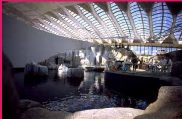
The Biodôme is a glass-roofed nature preserve showcasing four different ecosystems.