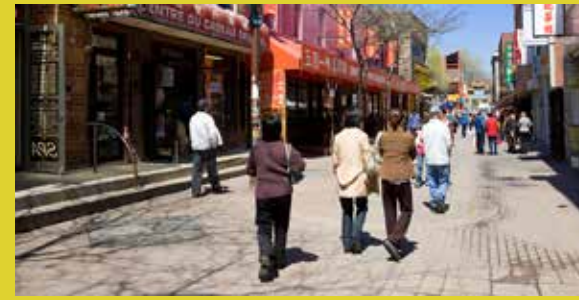
Montréal's Chinatown is famous for its wealth of Asian markets and restaurants.