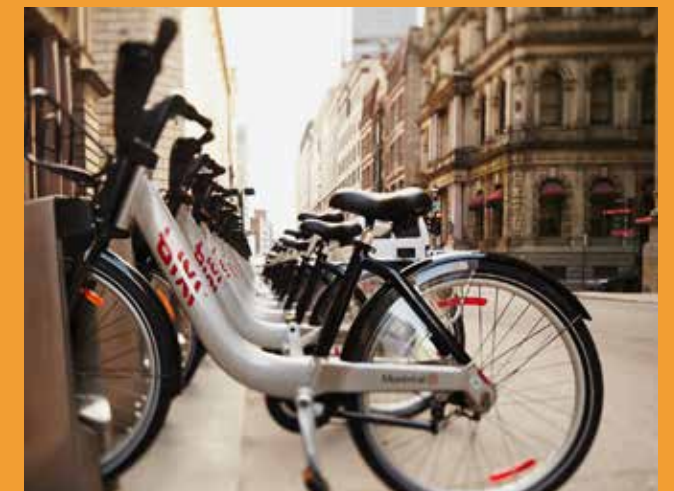
BIXI bikes may be rented at over 500 stations throughout Montréal and may be returned to any station.

Tel: +1 650.738.1200 Email: sponsor@chi2018.acm.org chisponsors@comcast.net