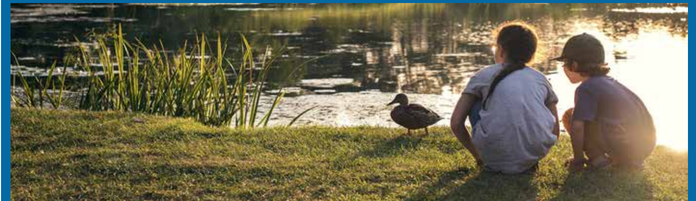
The Montréal Botanical Garden has almost 200 acres of themed gardens and greenhouses, as well as one of the most extensive plant collections world wide.