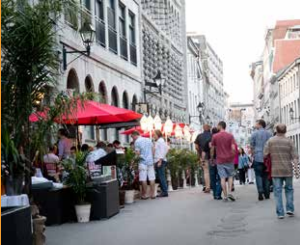
BIXI bikes may be rented at over 500 stations throughout Montréal and may be returned to any station.