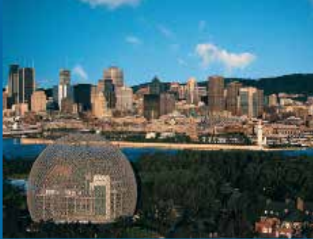
Montréal Biosphere museum dedicated to the environment.